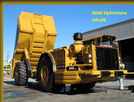
AD40 Elphinstone rebuild