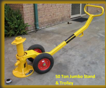
50 Ton Jumbo Stand & Trolley

CME Boilermaking is a privately owned WA company. Our scope of works ranges from completing work for machine dealership, mining contactors, shires/government and the public either in the workshop or onsite. Our workshop is located in Midvale not far from both the Great Eastern and Northern hwy. We are not limited in the work we complete from small repairs to new designs and fabrications.