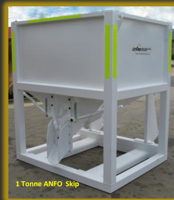
1 Tonne ANFO Skip