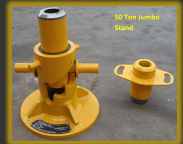
50 Ton Jumbo Stand